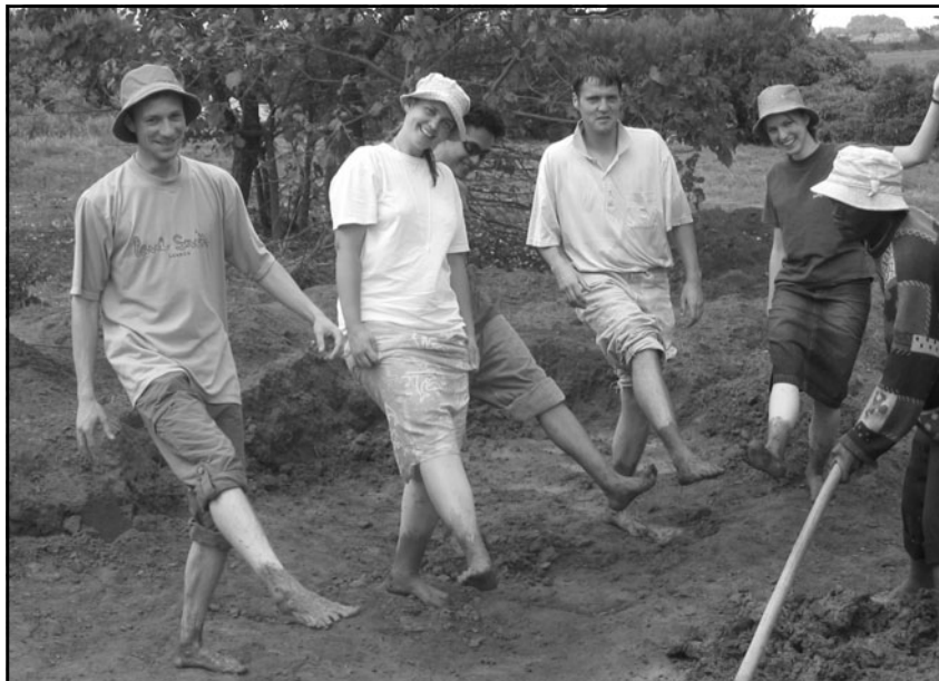
Hey guys! Are you playing in the mud again??