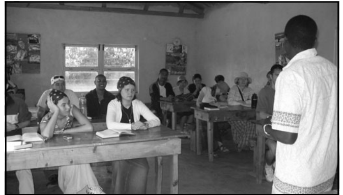
Below: The students attended classes every week-morning and did some physical work in the afternoons.