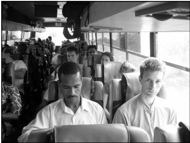
Top: It is quite fitting that the students, arriving from Norway, traveled with a bus called 'Scandinavia' when they arrived in Dar Es Salaam, Tanzania.