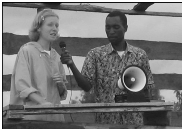
The students were divided into 3 groups and went to different villages for a whole week where they preached, taught, sang, prayed and a whole lot more.